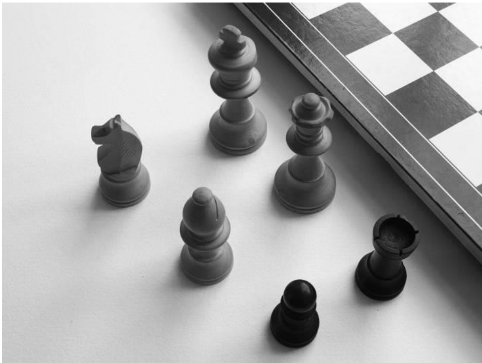
Figure 1: Staunton pieces hierarchy - most popular (official) model of chess set, designed by Nathaniel Cook, 1849.

Over time, a wide variety of chess sets have been designed, incorporating a range of shapes and materials. Some are handcrafted in stone, ceramic, wood or, in former times, ivory, while others are mass-produced from metal, glass or plastics like ABS. The 19 th -century Staunton chess set design (Figure 1) was created by the British designer Nathaniel Cooke who registered his design at the London patent office on March 1, 1849. Its increasing order of height expresses the hierarchical sequence of pawn, rook, knight, bishop, queen and king. Today, it is the most well-known chess set design and was adopted for international tournaments by the Fédération Internationale des Échecs (FIDE) in 1924. It allows players of different origins and language to play together without encountering problems identifying the pieces (FILGUTH, 2008, p. 158).