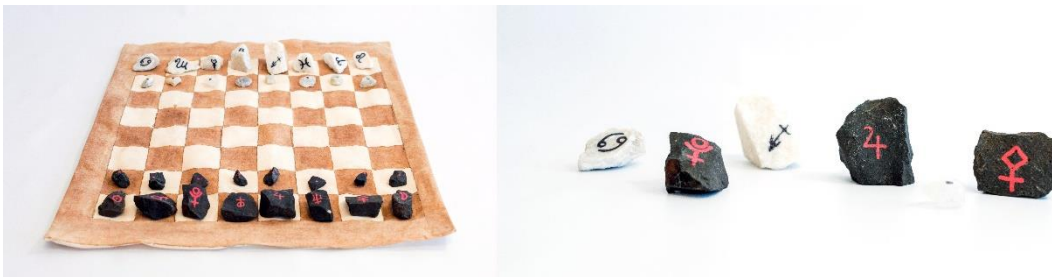
Figure 5: Mythology Signs (2019)

Briefing A: Example 2: This design (Figure 4) also takes the fauna as its theme, but here the students, Felipe Nielsen, Felipe Nunes, Giovanna Martins and Nayara Miranda represent Atlantic forest animals. The chessboard has a wooden base, with the alternating squares created with glued sand and soil and decorated with leaves, small stones and seeds. The pieces are modelled by hand using local natural clay and coloured with water-based paint. The animals were chosen based on colour, e.g. Red Macaw ( Ara chloropterus ) versus Yellow Macaw ( Ara ararauna ): same genus, different species. Despite being supervised, this group failed to deepen their research and seek technical advice on biogeography. Consequently, they confused both the zoological classification and geographic distribution of some species.