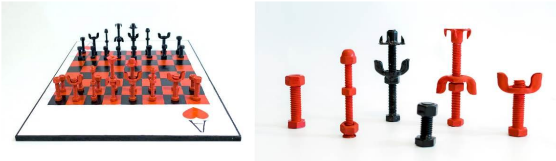
Figure 8: Deck of Cards (2019)

Briefing B: Example 6: The final design (Figure 8) explores the theme of playing cards. Juliana Faria, Viviane Aiko, Victoria da Silva and Rodrigo Sousa wanted to have fun with two different kinds of play sets. The chess board, made from a piece of reused MDF, has a large playing card painted on both sides. MDF (Medium-Density Fibreboard) is wood-based sheet composite used by the Uberlândia furniture industry and in construction and other applications. As a material, it presents one of the greatest challenges for local sustainability due to the excessive amounts being discarded, around 300 tons every month, and the material's toxicity due to urea-formaldehyde resin in its composition. The chess pieces are also made from waste furniture industry components. They are pieces of threaded bar sawn into hierarchical heights and identified by different configurations of nuts and other threaded elements. Despite the availability of the various parts and their ability to allow different configuration, there was a technical problem. The ratio between thickness and height of the chess pieces makes them unstable. A proposal was suggested to these students to resolve this.