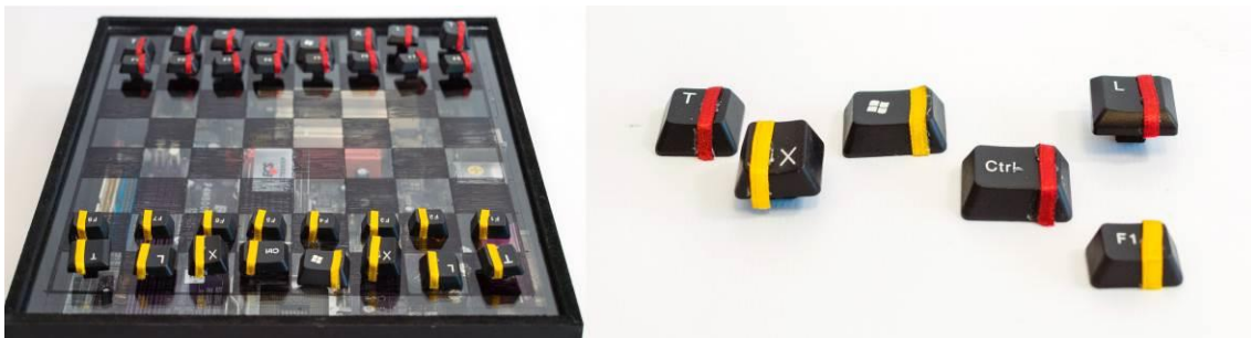
Figure 7: CPU Hardware (2019)

Briefing B: Example 4: Using the theme of social media, technology and complexity, Humberto Guedes, Giuseppe Iannarelli, Mirilayne Sabino and Eduarda Caxito transposed symbols of from the digital sphere to physical form (Figure 6), using large-scale discarded materials. Created in the format of a smartphone, the game board is made from scrap galvanized zinc sheet; a commonly material in Brazilian construction, used for roofs and walls. The pieces are made from discarded printer cartridge seals (clear acrylic) and discarded refrigerator rubber. The surfaces of both game board and pieces are printed adhesive paper waste. The hierarchy is defined by graphic symbols in the top of the botons (pieces).