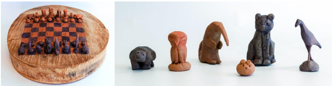
Figure 3: Brazilian Cerrado animals (2019)

Among the nine artefacts developed by the students, six are presented here, illustrating findings from both briefings. Figures 3, 4 and 5 express the ideas of a creative search using local natural materials and a handcrafted process i.e. Briefing A. Figures 6, 7 and 8 reflect a search of local reuse and waste materials for repeatable design (for industrial and/or open source production/distribution) i.e. Briefing B. The artefacts are accompanied by a short description of the materials and techniques employed, including the meanings of the themes chosen by the groups, and their respective authorship.