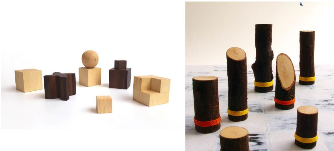
Figure 2: Left - Replica of the Bauhaus chess set designed by Josef Hartwig in 1923/24. Image by L. Pantaleão Right - Balanis chess set designed by Stuart Walker in 2014. Image by S. Walker

designs are the Bauhaus set by Josef Hartwig 6 , 1923/24 (Figure 2 left) and the Balanis set (Figure 2 right) by Stuart Walker, 2014: