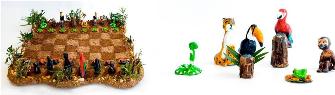
Figure 4: Brazilian ('Atlantic') animals (2019)

The hierarchical differences are reflected in the height of each piece. Despite their dedicated efforts, this group reported difficulty in mastering the modelling technique, which is understandable, but naturally compromised the quality of the final forms.